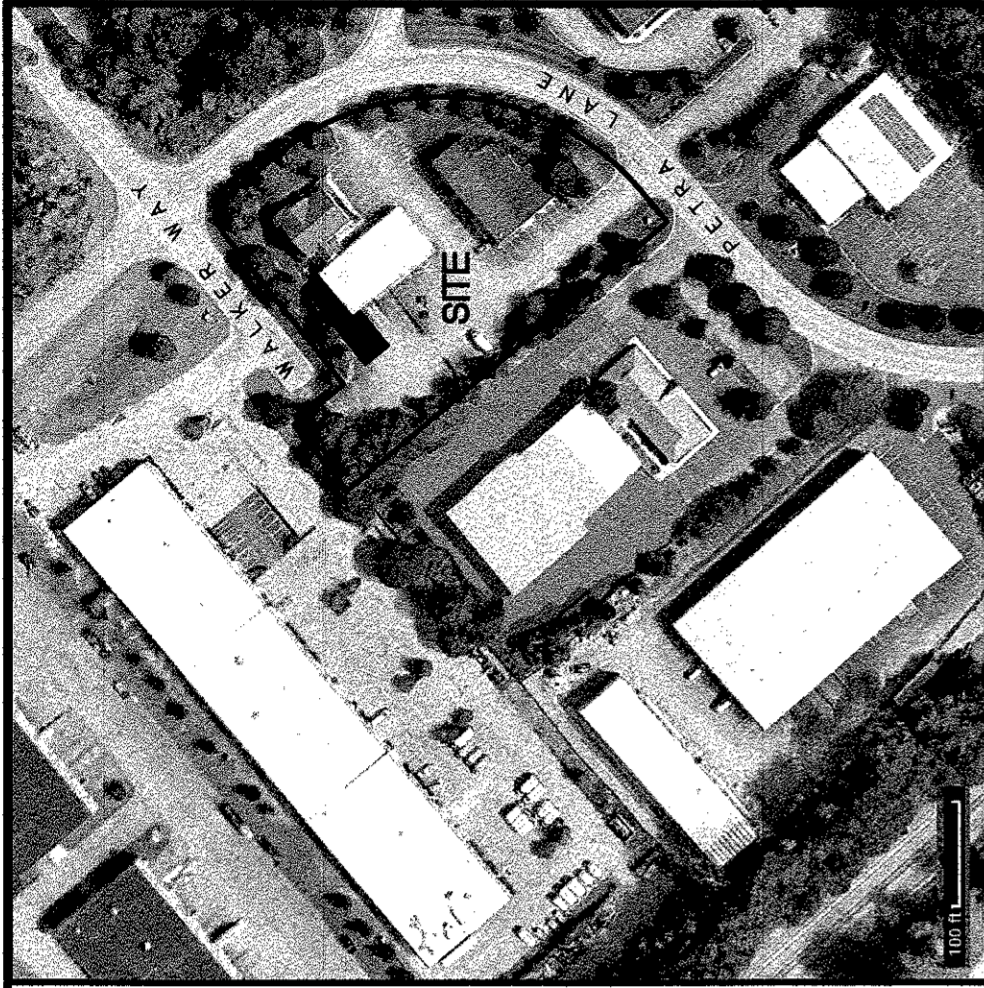
VICINITY MAP SCALE AS SHOWN