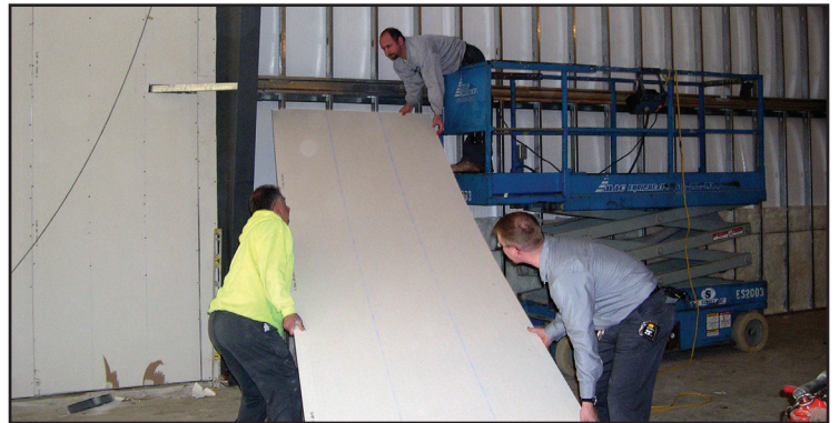
Village DPW workers hang 16 foot sheet rock panels in Rec gym.