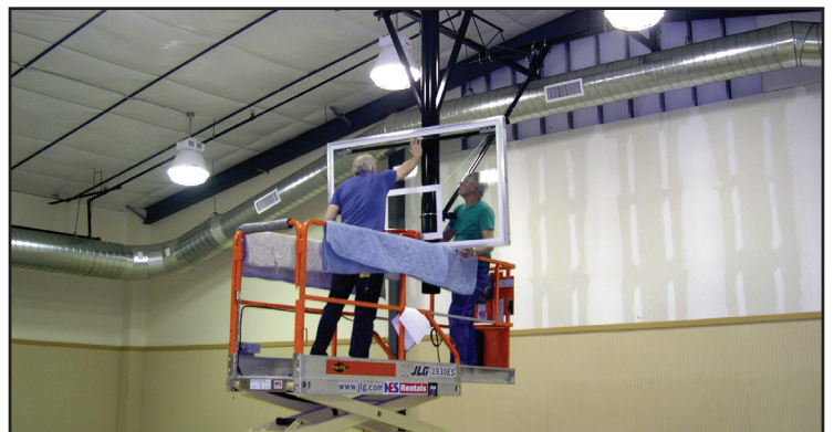
Hanging the basketball hoops in the Rec gym.