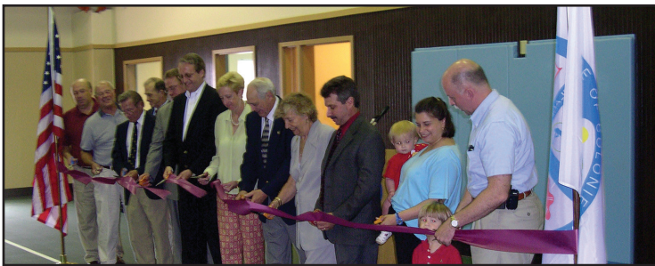
Ribbon cutting at Grand Opening, June 11, 2005.