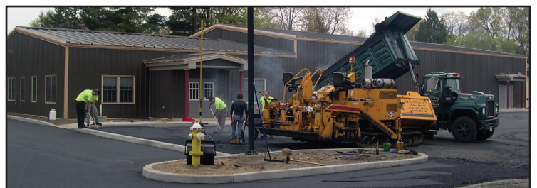
Paving the Rec parking lot.