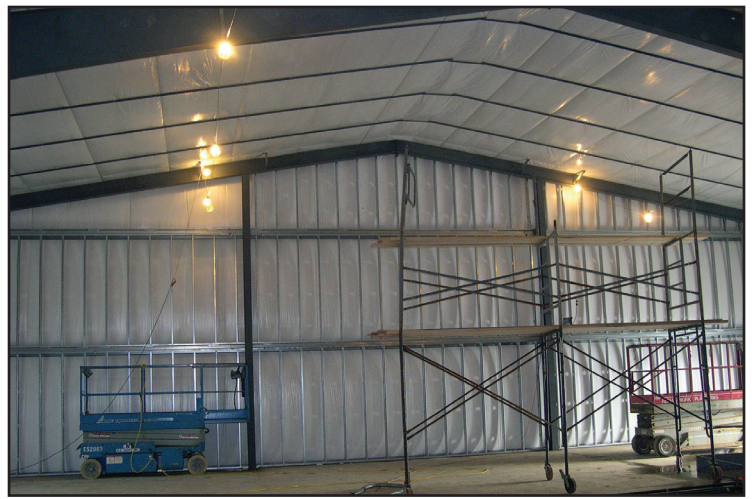
Interior construction of Rec Center gym.

"The mission of the Village of Colonie Family Recreation Center is to improve the quality of life in the Village of Colonie area, by providing facilities and programs where people of all ages can enjoy a variety of recreational activities safely, inexpensively, and in a wholesome environment. The Center is designed to meet the physical and social needs of youth and adults alike. It is intended to provide a wholesome family atmosphere that will encourage a lifelong commitment to health and fitness."