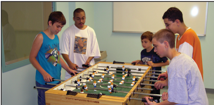
Local kids playing in Rec Center game room during Grand Opening, June 11, 2005.