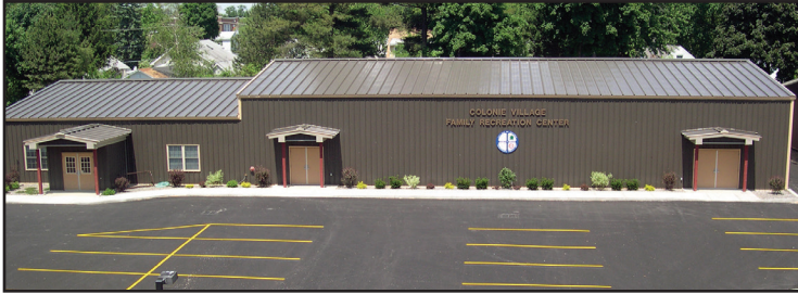
Finished exterior construction of Rec Center, 2005.