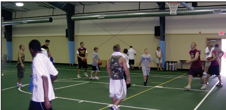
Local kids using the basketball gym for the first pick up game at the Rec Center Grand Opening, June 11, 2005.