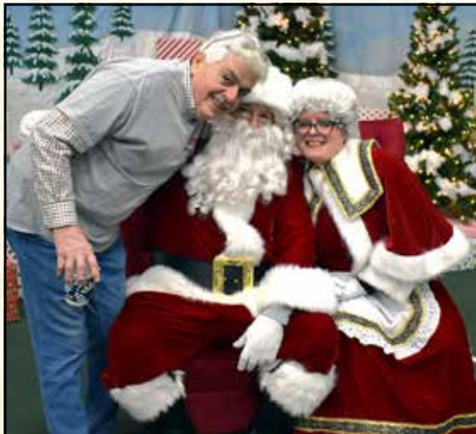
The Mayor takes a coffee break from serving breakfast alongside the Board and volunteers to thank Santa and Mrs. Claus for stopping by the Village's Breakfast with Santa event.