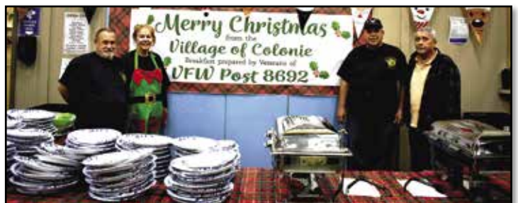
A huge thank you to the dedicated team at VFW Post 8629! They generously provide the food for Breakfast with Santa and volunteer their time to prepare the meal each year.