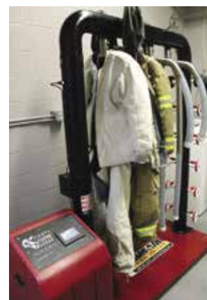
Photo of the New Gear Dryer

The Village of Colonie also applied for and received funding through the Albany County Parks and Recreation Department for the purchase of new picnic tables and benches for our Locust Park. The new tables and benches will bring a fresh look to the park for all residents to enjoy. The benches and tables will be arriving this spring!