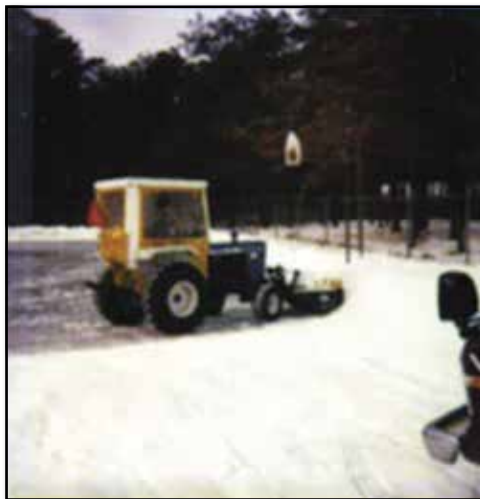
Village Zamboni of 1982