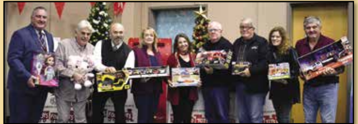
The Mayor, along with the Board and staff, in collaboration with the South Colonie Superintendent and the School Board President gather the Toys for Tots donations and "Stuff the Bus"!