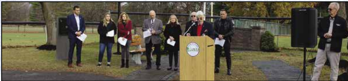
Mayor, Village Board and staff.