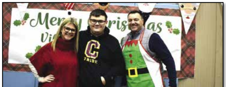
Pictured are a few of our wonderful volunteers! We are so grateful to everyone who helped make our Breakfast with Santa event a success. Their hard work and positive cheer truly made a difference!